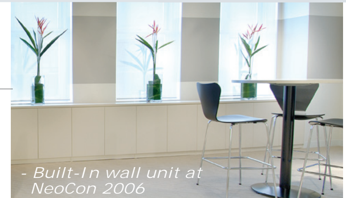
- Built-In wall unit at NeoCon 2006

Back-to-Back Call Centers one piece units reduce numbers of parts and the cost!